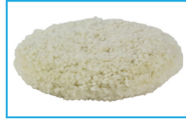
G Mop 8" Twisted Wool Pad - Double Sided GMW806