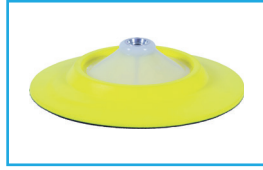
G Mop Flexible Back Plate for 8" Pads GMB814 (14mm thread) GMB858 (5/8" thread) GMB816 (16mm thread)