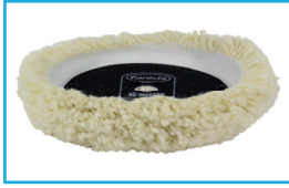
G Mop 8" Twisted Wool Pad - Single Sided GMW801