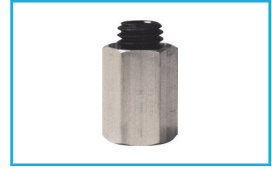
Adaptor for G Mop 8" Double Sided Wool Pad GMA014 (14mm thread) GMA058 (5/8" thread) GMA016 (16mm thread)